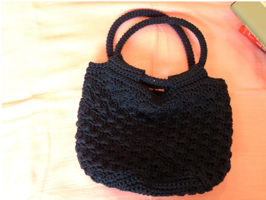
You can see how the two loops hold the handle here.