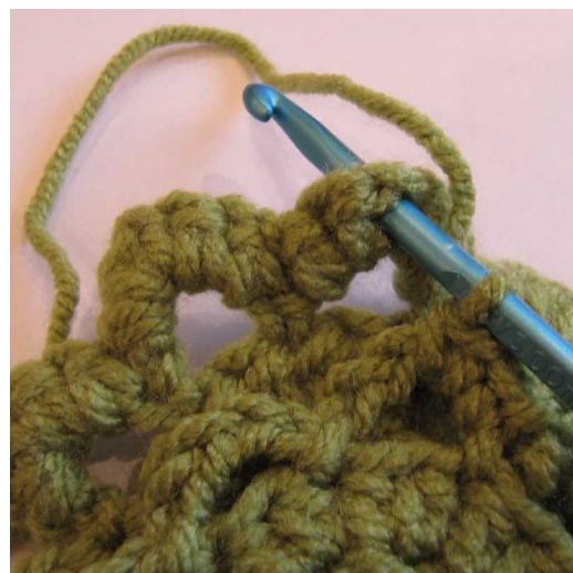
Joining the first two motifs together