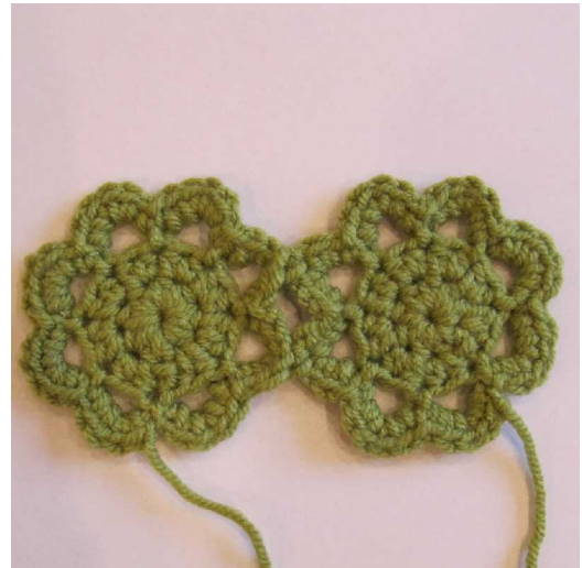
The two motifs joined together

You should now have a total of 7 joined motifs. On the eighth one you will join the petals on both sides to close the band like a circle.