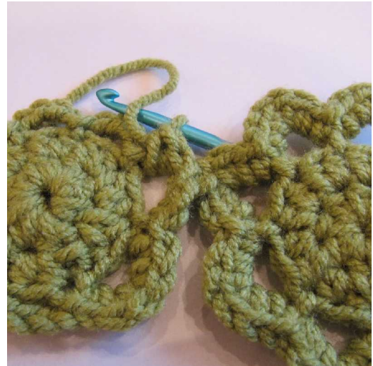
Joining the first two motifs together

Turn the motif right side facing and continue the remaining two SCs on the chain of the second motif. You should now have one petal join with the first flower at a single point.