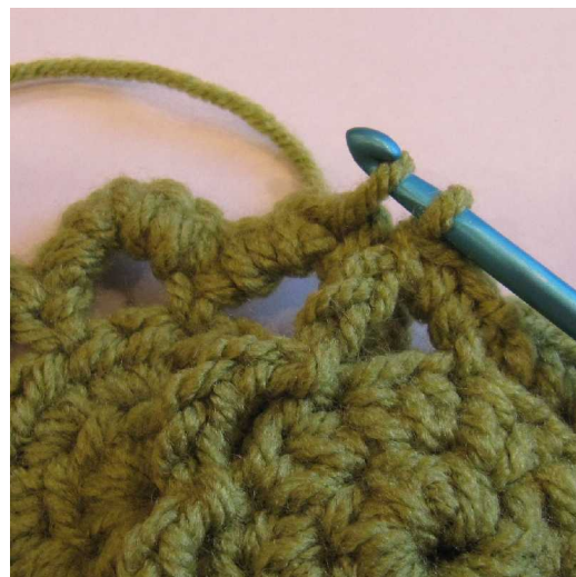
Joining the first two motifs together

Pull the loop through your first loop on the hook. You should now be left with only one loop. This is like slip stitching the two flowers together.