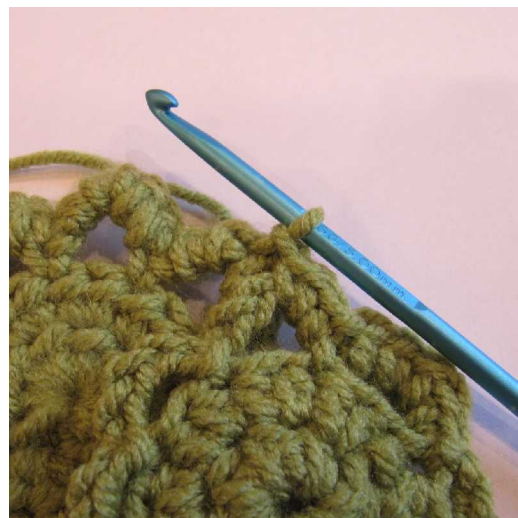
Joining the first two motifs together

Pull the loop through your first loop on the hook. You should now be left with only one loop. This is like slip stitching the two flowers together.