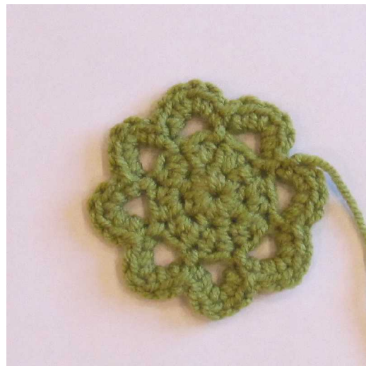
First Completed Motif

For the next motif, work rounds 1 to 3. Work only the first 2 SC from round 4 into the chain space. Then hold the motif that you will be joining into wrong side facing to the one you are already working with. Insert your hook into the chain space created by the CH 1 in the first flower in the fourth round.